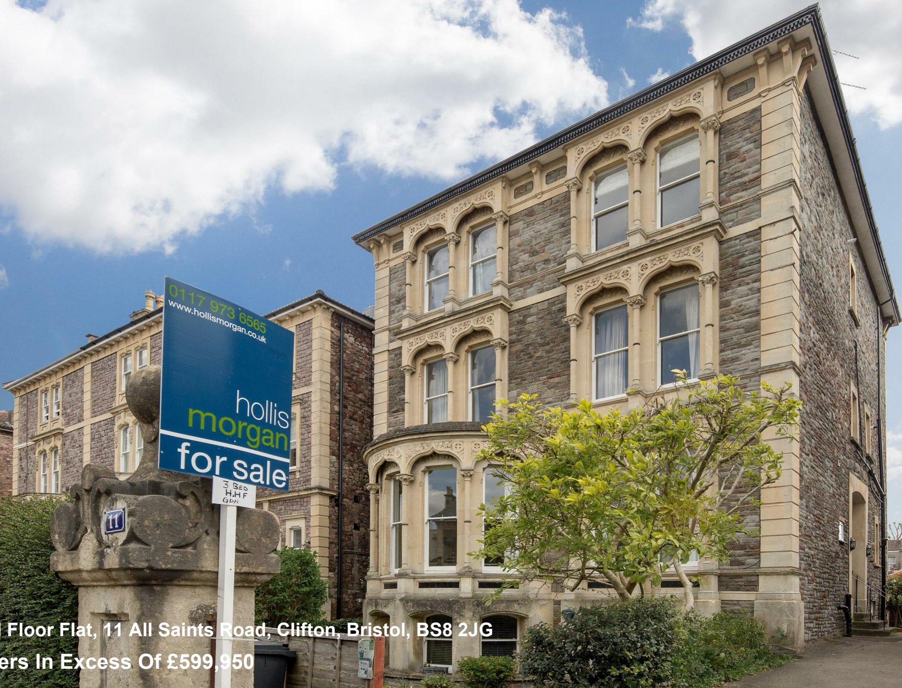
Hall Floor Flat, 11 All Saints Road, Clifton, Bristol, BS8 2JG Offers In Excess Of £599,950