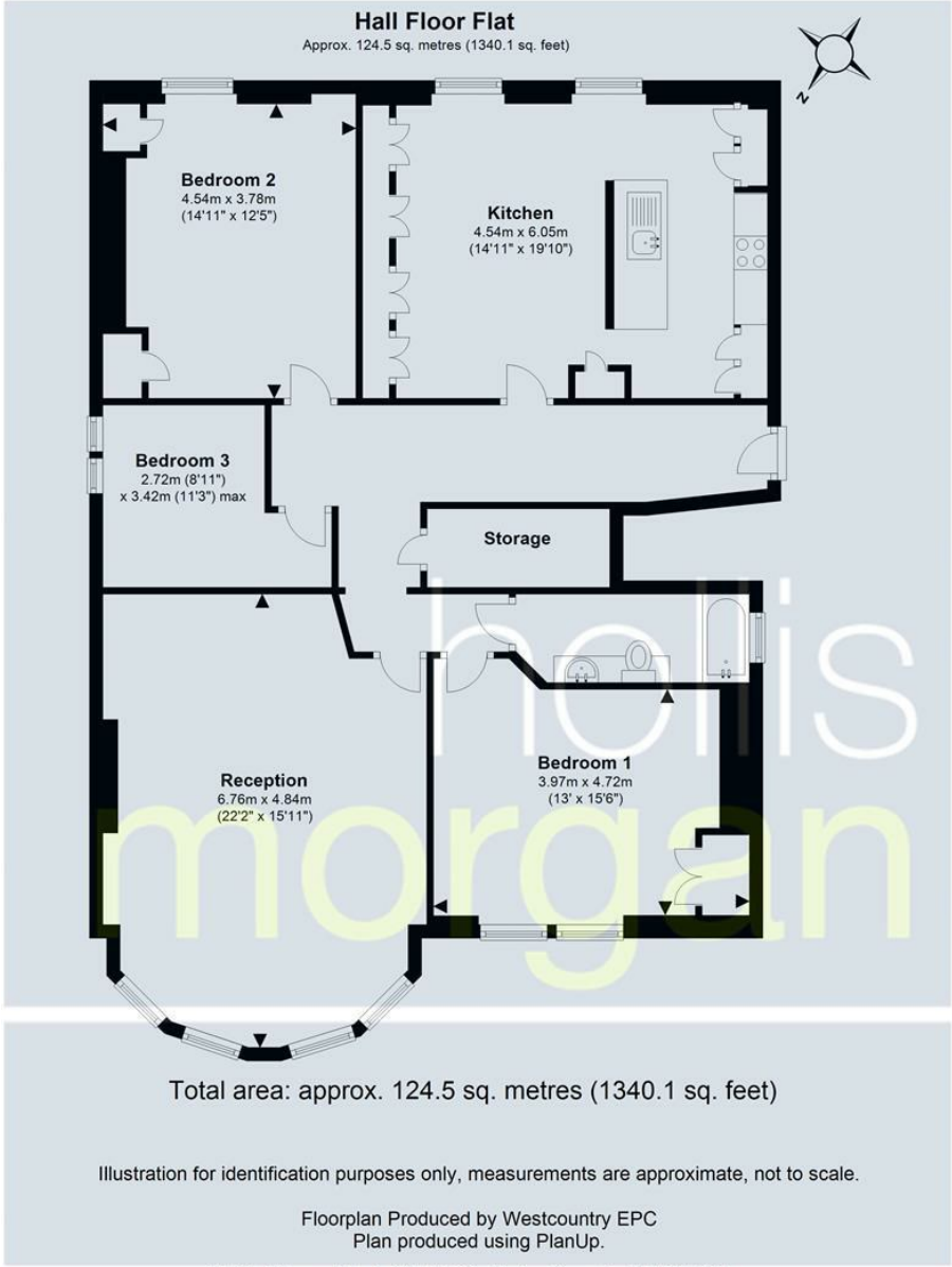
Hall Floor Flat 11 All Saints Road, BRISTOL

TEL | 0117 933 9522 | 9 Waterloo Street, Clifton, Bristol BS8 4BT